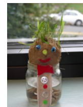
Sammy Soil Buddy!