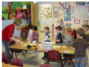
Earth Day Bracelets!

When: Throughout the school year, call for appointment