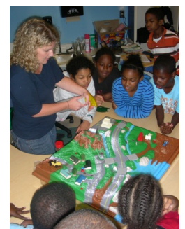
Enviroscape Watershed Model

When: Throughout the school year, call for appointment